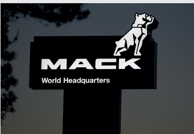
Fig. 2: Daytime and nighttime effect