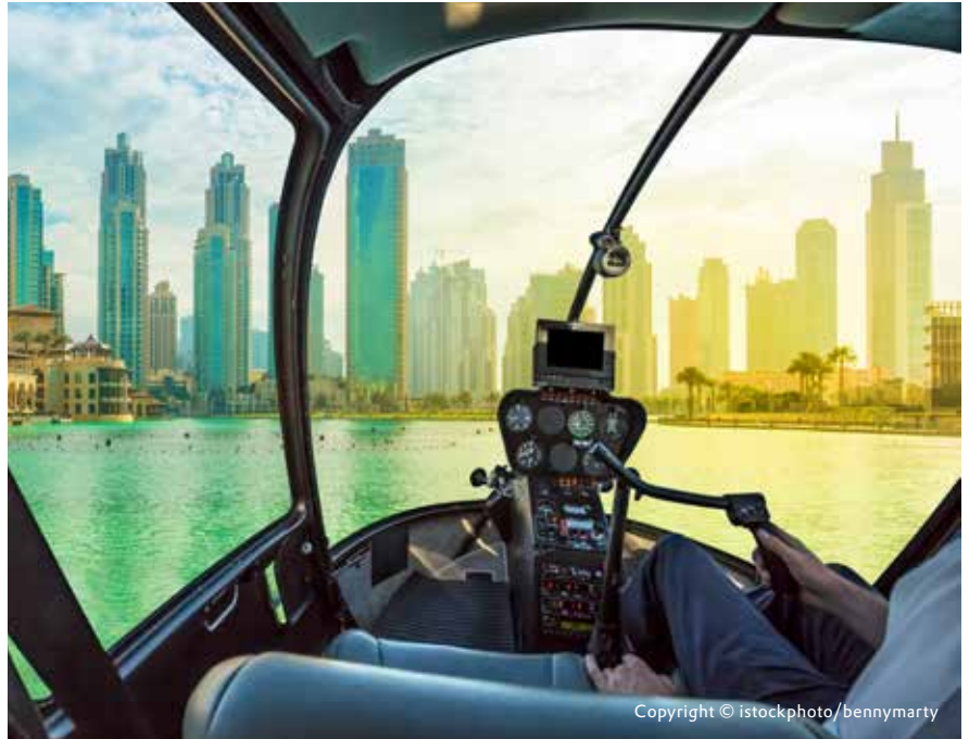
PLEXIGLAS® Grey 7YS15 Solar vs Industry Standard Light Grey

The UV and IR radiation absorbing material has the same physical properties as the corresponding PLEXIGLAS® product into which the features are included. The UV filtering is improved and the IR radiation is blocked even though the color impression in the visible range is maintained. The UV IR absorbing feature improves UV blocking up to 99.9%.