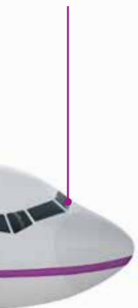
AIRCRAFT COCKPIT WINDOWS

The aviation acrylic sheet products include: PLEXIGLAS® GS 249 aviation grade, which is a cross-linked acrylic sheet. PLEXIGLAS® GS 249 meets prEN 4365. Furthermore it is qualified by the US Navy to meet Military Specification MIL-PRF-8184 as a Type I, Class 2 material. As such, it is also suitable for Type II and Class 1 applications. PLEXIGLAS® GS 245 aviation acrylic sheet meets prEN 4364 and is qualified by the US Navy to meet the requirements of Military Specification MIL-PRF-5425. Furthermore, PLEXIGLAS® Stretched is qualified to prEN 4366 as well as MIL-PRF-25690. Together with our products we offer our customers competent application-oriented advice, custom-tailored solutions and compliance with all relevant standards and specifications.